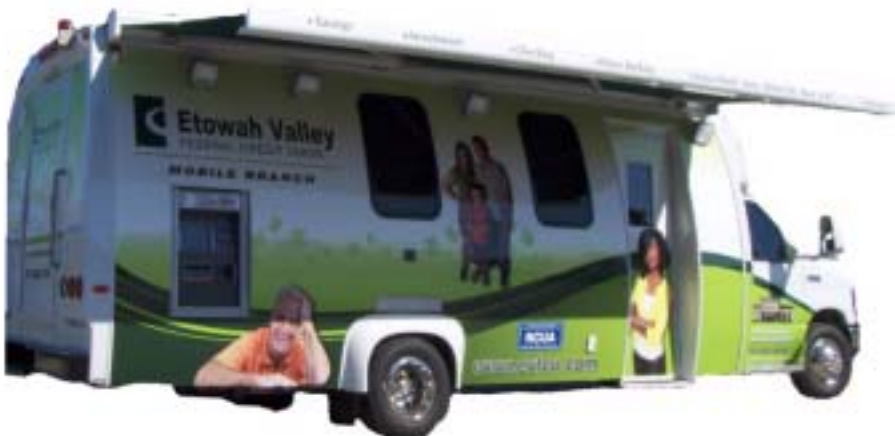
Photo of EVFCU Building on Mobile Branch provided compliments of Cline Photography of Adairsville.

The mobile branch will be used at many functions and events giving the community easy access to an ATM. If you're going to be out and about, keep an eye out for the EVFCU mobile branch!